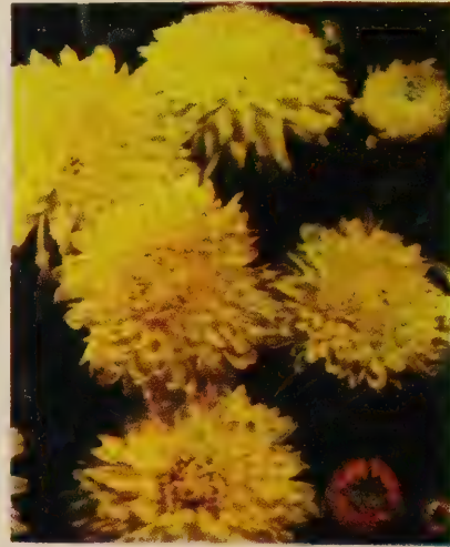
DELIGHT. 60c each; 3 for $1.50